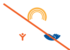
Never extract any of the graphic elements or words "United Way" contained in the brandmark to use separately