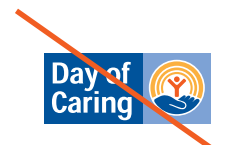
Never put other words or phrases inside the brandmark